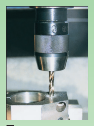
1 Drill coolant passage, leaving reaming allowance.