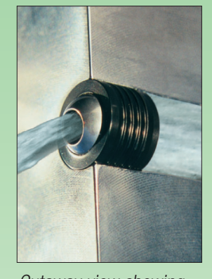
Cutaway view showing JiffyJet installed.